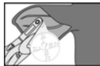
Figure 3 Position tag in the center portion of the front side of the ear.