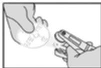
Figure 2 Slide tag under the clip of the pliers by depressing the lever.