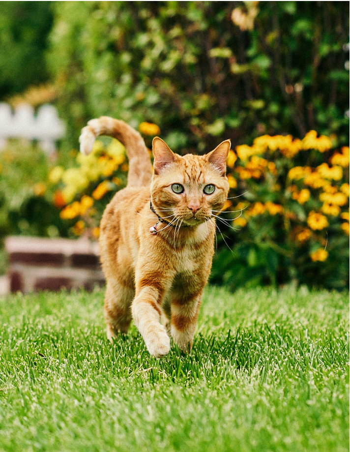
Efficacy Against Ticks 7

Credelio Cat is approved for the treatment and control of I. scapularis in cats 6 months and older weighing 2.0 pounds or more.