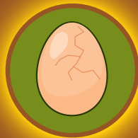
Fragile shelled eggs