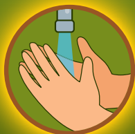
Always wash hands before and after interaction with your flock