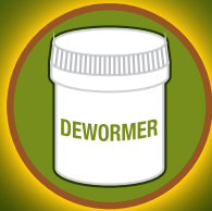
Use an effective in-feed broad-spectrum dewormer