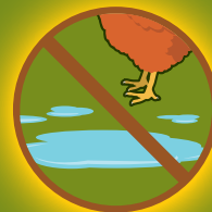
Reduce standing water in the pen – fence off wet areas or move your chickens' pen occasionally