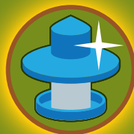
Keep drinkers and feeders clean, moving them regularly