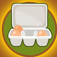
Reduced egg production

Some signs they are infested could include 1,2 :