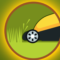
Keep grass short to allow maximum exposure of parasitic worm eggs to sunlight, as UV rays can kill parasitic worm eggs