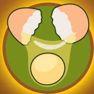
Eggs with pale yolks