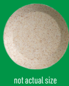
not actual size

Comes in a tasty beef-flavored chewable tablet formulation